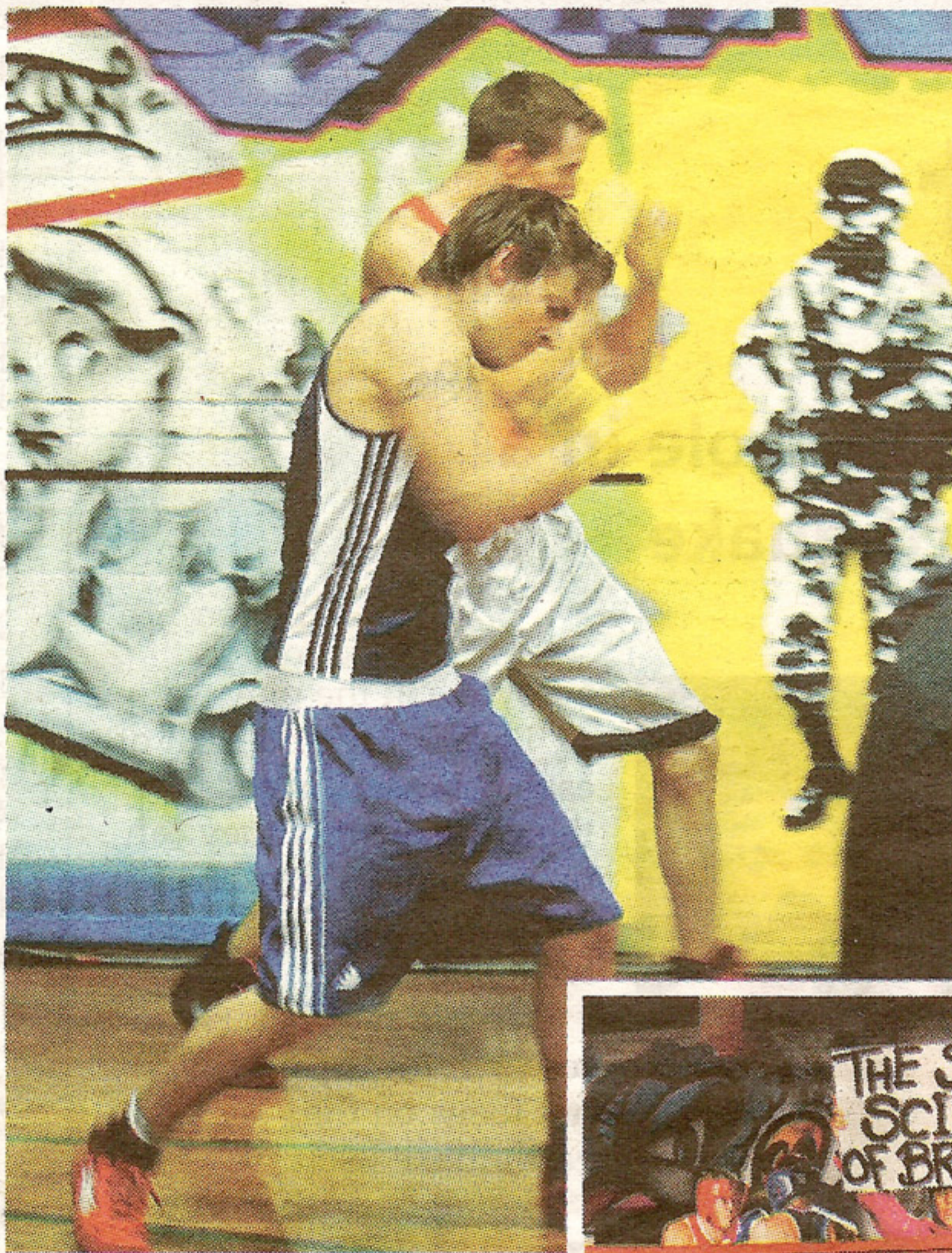
A scene in Gloves On

"It goes through to a retired boxer and what life's like, and the loss they feel when something so important has gone from their lives. That's a question on a much broader scale about life in general –